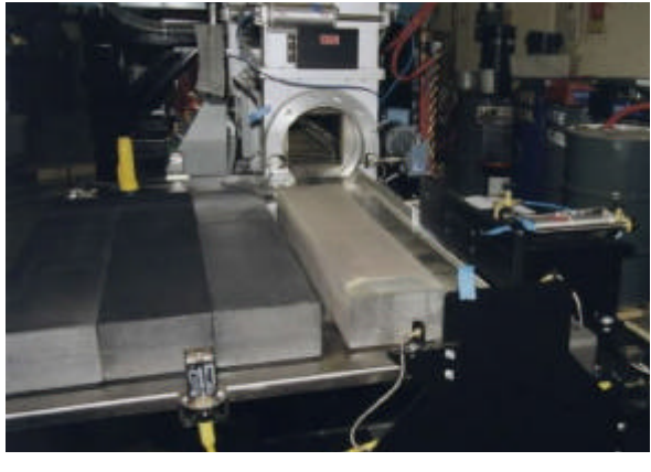
Graphite workbox being transferred to entrance load lock.